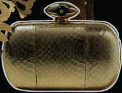
Diane Von Furstenberg