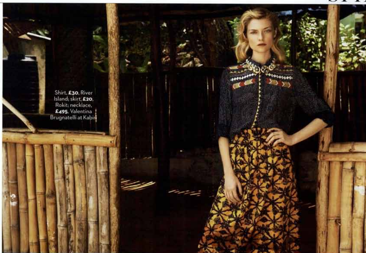
Shirt, £30 , River Island; skirt, £20 , Rokit; necklace, £495 , Valentina Brugnattelli at Kabir