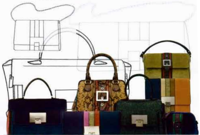
www.azzurragronchi.com Azurra Gronchi has always been surrounded by precious materials, as she is the daughter of illustrators at one of Italy's most important lanterns. She established her brand after various collaborations with fashion houses. "Egypt's colours and scents form the backdrop to my collection, where the protagonists are warm nuances recalling the sun and earth: brown, yellow, bottle green, red and orange. The leitmotiv of the FW 2012-13 collection is gold, luminous, shiny and sumptuous."