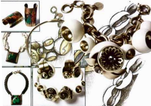
www.valentinabrugnatelli.com Valeria Brugnattelli, born in Italy and educated in Switzerland, studied fashion design in Paris. Based in Geneva, she works as a freelance in Milan and Paris for prestigious fashion houses. "When architecture meets nature: this is my inspiration. My 2012-13 collection is a collision between soft metal flower shapes and geometric resins in a delicate balance on top of a metal choker... or a cabochon of malachite melting into splashes of textured and colourful enamel."