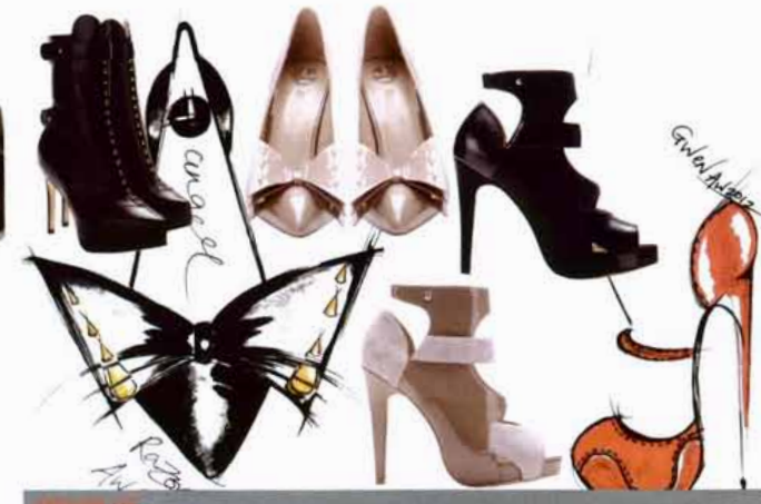
www.angelinelee.com "My FW 2012-13 collection delves into the fantasy wonder-dark world of Hansel and Gretel, a fairytale of innocence and temptation, laced with sinister bewitchery. Each silhouette holds its presence in different ways. Towering pumps add poise with curves that invite curiosity. Fluid and simple ankle boots and ballet slipper pumps are contrasted by using intricately embossed and laser-cut calf hair," explains Angelina Lee, who trained as a sculptor, gaining a BA at the Slade School of Fine Art before obtaining a place at the prestigious Royal College of Art, thanks to her "insane love of footwear."